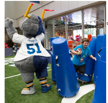
cr: College Football Hall of Fame